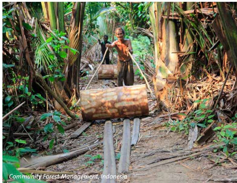
Community Forest Management, Indonesia

FOE INDONESIA AIMS TO SECURE PEOPLE'S LIVELIHOODS AND THE ENVIRONMENT AT THE SAME TIME.