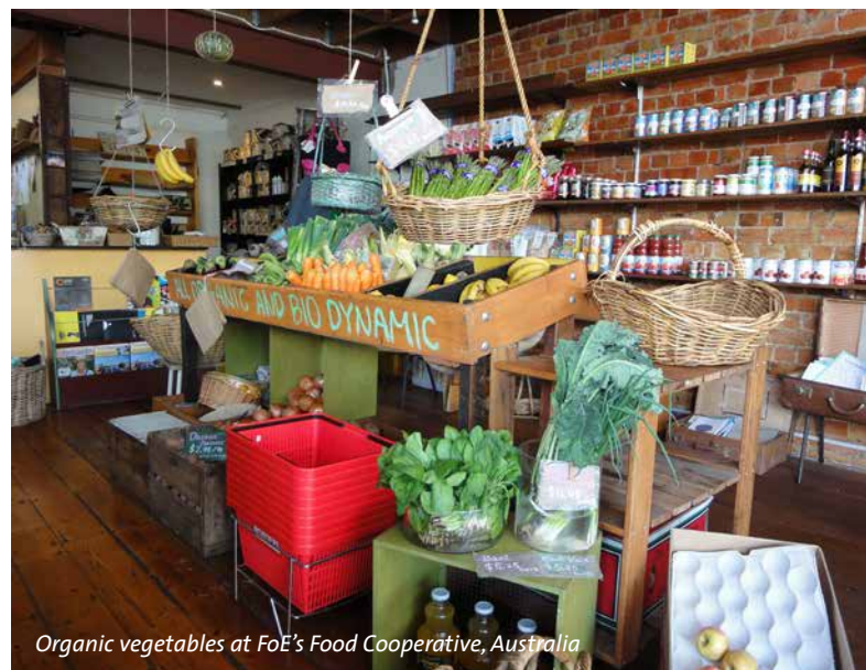
Organic vegetables at FoE's Food Cooperative, Australia

COOPERATIVES PROVIDE A DEMOCRATIC ALTERNATIVE TO THE CORPORATE BUSINESS MODEL.