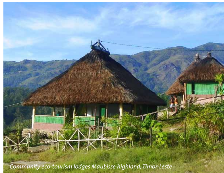
Community eco-tourism lodges Maubisse highland, Timor-Leste

DEMONSTRATING THAT ETHICAL, EQUITABLE AND ECOLOGICALLY SUSTAINABLE TOURISM IS POSSIBLE.