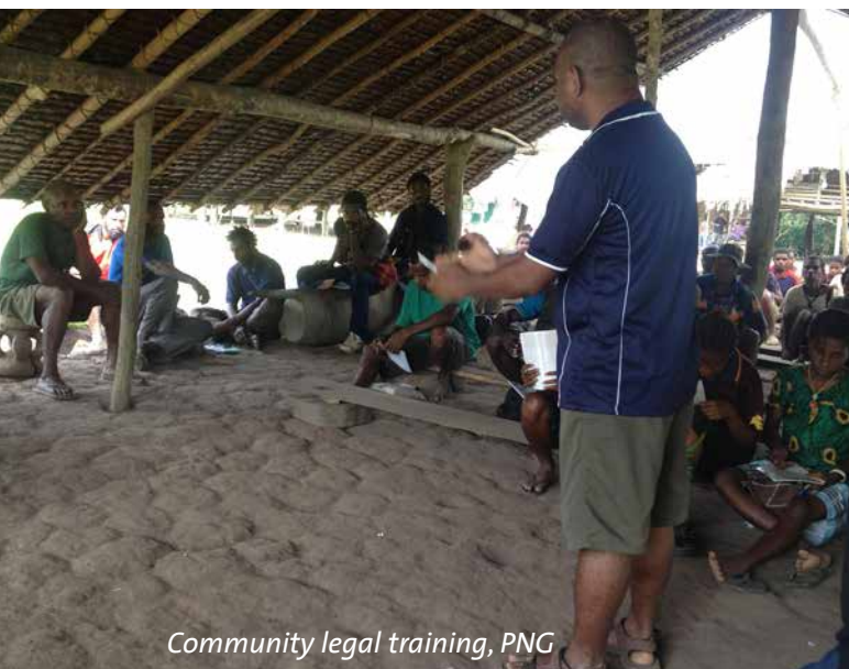
Community legal training, PNG

FOE PNG USES THE COURTS TO DIRECTLY CHALLENGE ILLEGAL LAND GRABS AND IN DOING SO AIMS TO SET A PRECEDENT TO STOP FUTURE HUMAN RIGHTS ABUSES.