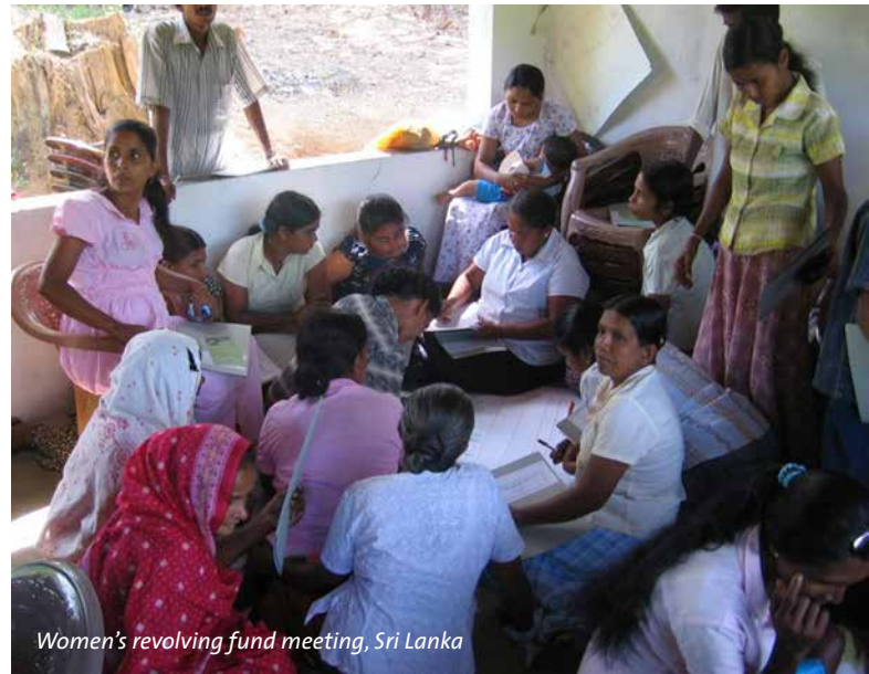
Women's revolving fund meeting, Sri Lanka

Thus the concept of a revolving fund was born to assist communities in troubled times and with the aim of mobilizing the Nilgala communities for better forest governance. CEJ/FoE Sri Lanka created this revolving fund with the financial support of the International Union for the Conservation of Nature Sri Lanka. Nilgala Protection committees were created in